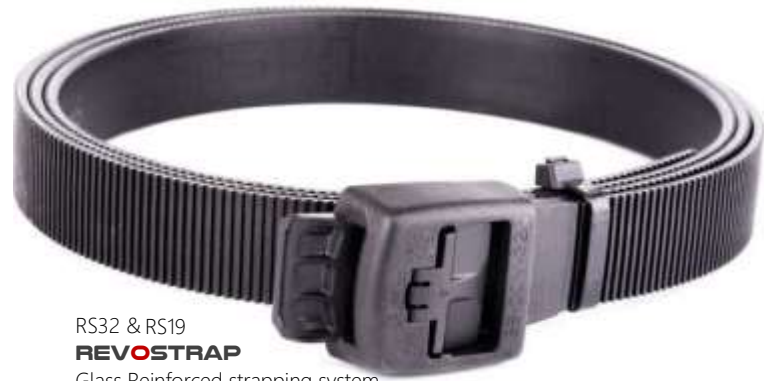
RS32 & RS19 REVOSTRAP

Glass Reinforced strapping system Designed strap around leaking pipes to seal leaks up to 35Bar Available in 19mm and 32mm widths