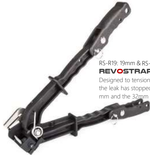
RS-R19: 19mm & RS-R32: 32mm REVOSTRAP RATCHET Designed to tension the Revostrap until the leak has stopped. Available for the 19 mm and the 32mm Revostrap systems

Glass Reinforced strapping system Designed strap around leaking pipes to seal leaks up to 35Bar Available in 19mm and 32mm widths