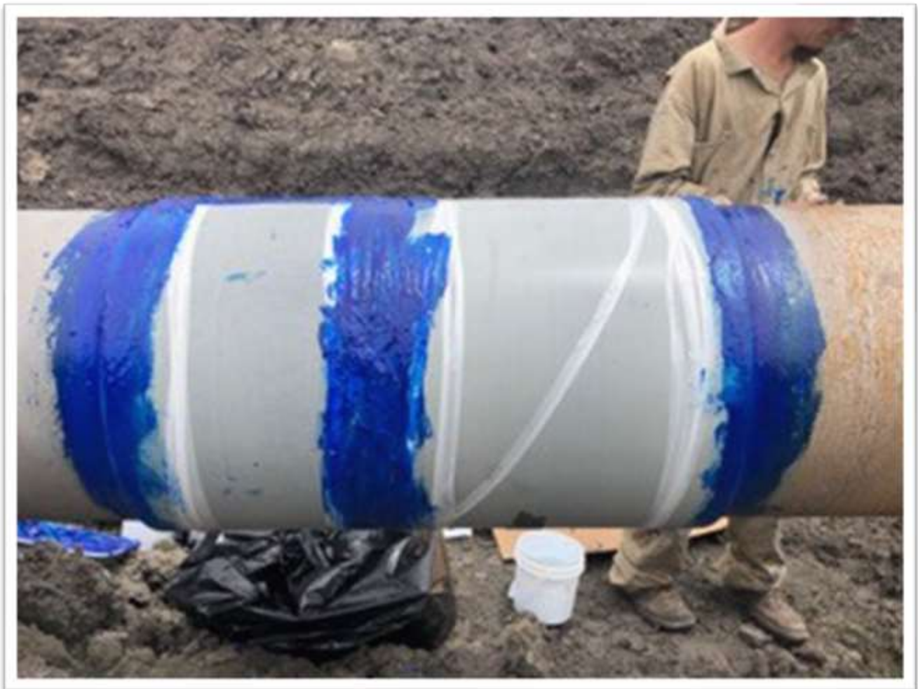
Fig 3: Completed Repair

Post cured: Not Required - Ambient cure system