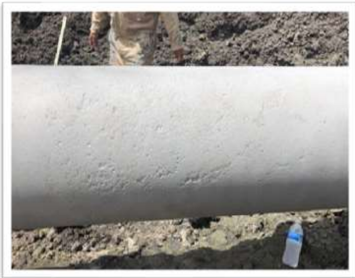
Fig 1: External Pitting